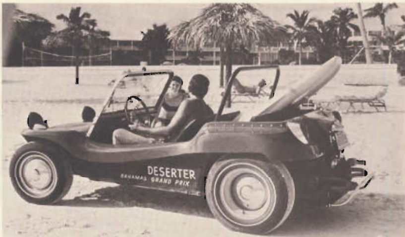
Two views of Autodynamics' Volkswagen-powered "Deserter" dune buggy. It performs equally well on the beach, in the woods and even on the highway.