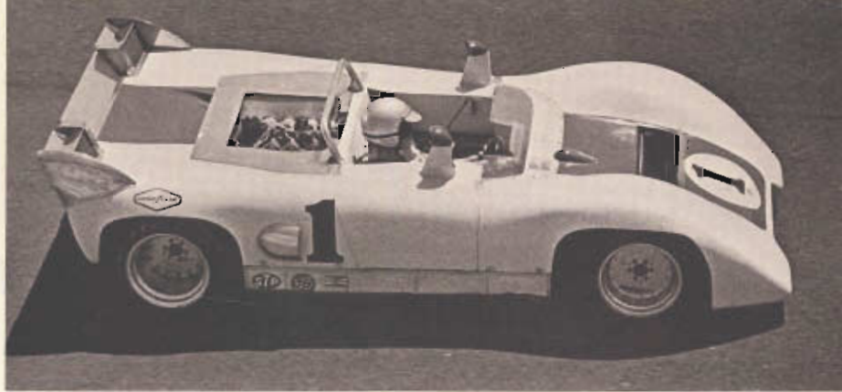
Above: The Caldwell D-7 sports car features solid axles; can hit 225 mph.

Inside, Caldwell's 35 employees move at a seemingly leisurely pace—the studied gait of careful men accustomed to working with precision machinery. Specialists in their fields, the men fabricate metal into race car frames and other parts, rebuild engines, transmissions and suspensions, and form fiberglass bodies and body parts.